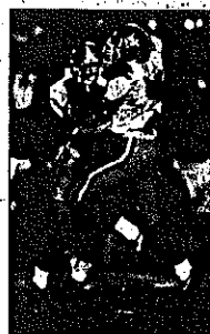
Thomasville defenders celebrate after recovering a third quarter Yellow Jacket fumbled punt return.