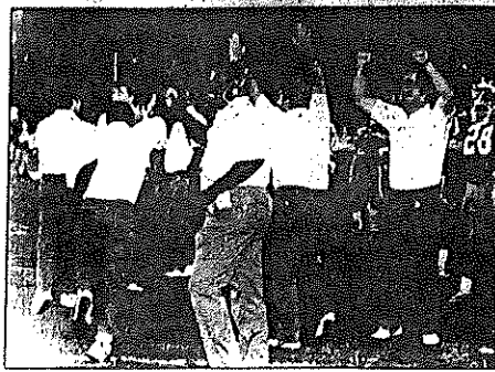
Thomasville coaches exult in celebration after blocked punt